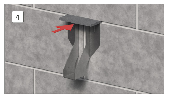
Tightly pack the void above the top of the hanger with an incompressible material (ie: slate) ensuring the full width of the hanger top flange is covered and the material is pushed all the way to the back of the slot, leaving the front 10mm of the slot clear.