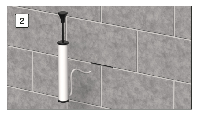
Brush and blow out all the dust and debris from the horizontal slot (ie: using a dust pump).