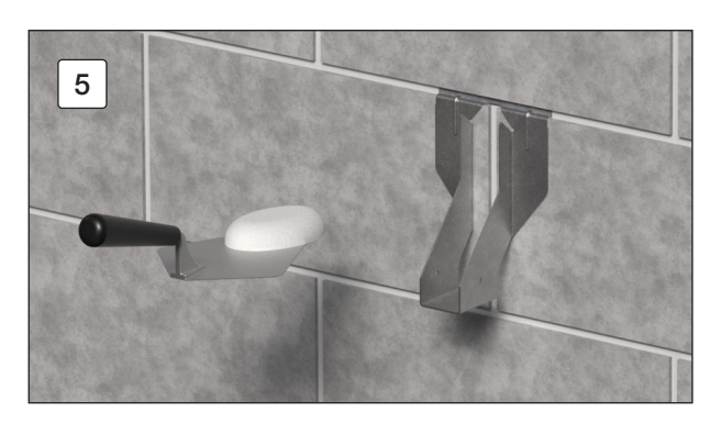
Force mortar or suitable epoxy resin into the slot and then allow to cure before applying load onto the hanger.

* The above installation method is applicable to all standard masonry hangers including: JHM, JHMI, HJHM and HJHMI.